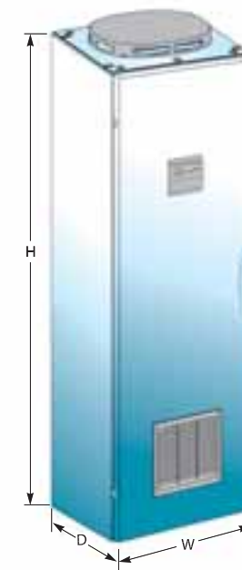
Prisma Plus Enclosure