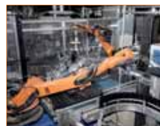
Varplus 2 capacitor assembly line